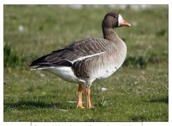
Greater White-fronted Goose, Anser alibifrons

As we announce at the end of our weekly reports, "The Monday Morning Bird Walk has been a weekly event at Huntley Meadows Park since 1985. It takes place every week, rain or shine (except during electrical storms, strong winds, or icy trails), at 7AM (8AM from November through March), is free of charge, requires no reservation, and is open to all. Birders meet in the parking lot at the Park's entrance at 3701 Lockheed Blvd, Alexandria, VA. Questions should be directed to Park staff during normal business hours at (703)768-2525." So, come on out and join us - 7AM in the summer, and 8 AM in the winter.