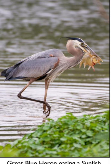
Great Blue Heron eating a Sunfish by Curtis Gibbens

I also met great photographers (photography has always been a very strong interest of mine). Some photographers were just starting, the way I did when I first came to the Park. I would give them pointers, such as early morning is the best time for pictures, because of the sunlight and activity. I also met photographers who had been shooting for years with lenses that cost as much as a car. They gave me pointers about aperture settings and exposure.